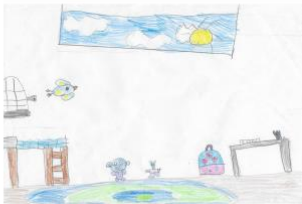
Χαμηλή πτήση/ Tittjira baxxa/ Low flight