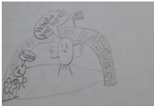
Συνάντηση με το Μαγκρί/ Laqgha ma 'Magree/ Meeting Magree