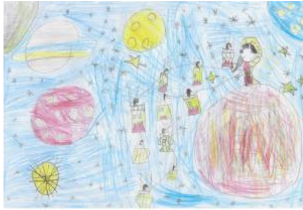
Τα Φανάρια του Ήλιου/ Il-fanali tax-xemx / The Lanterns of the Sun