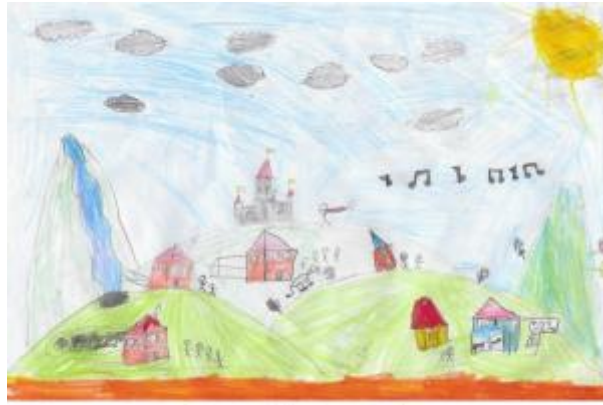
Το χωριό / Il-villagg/The village